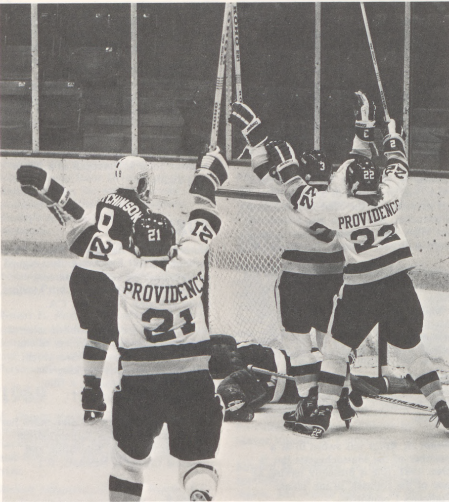
Lady Friars in action at Schneider Arena