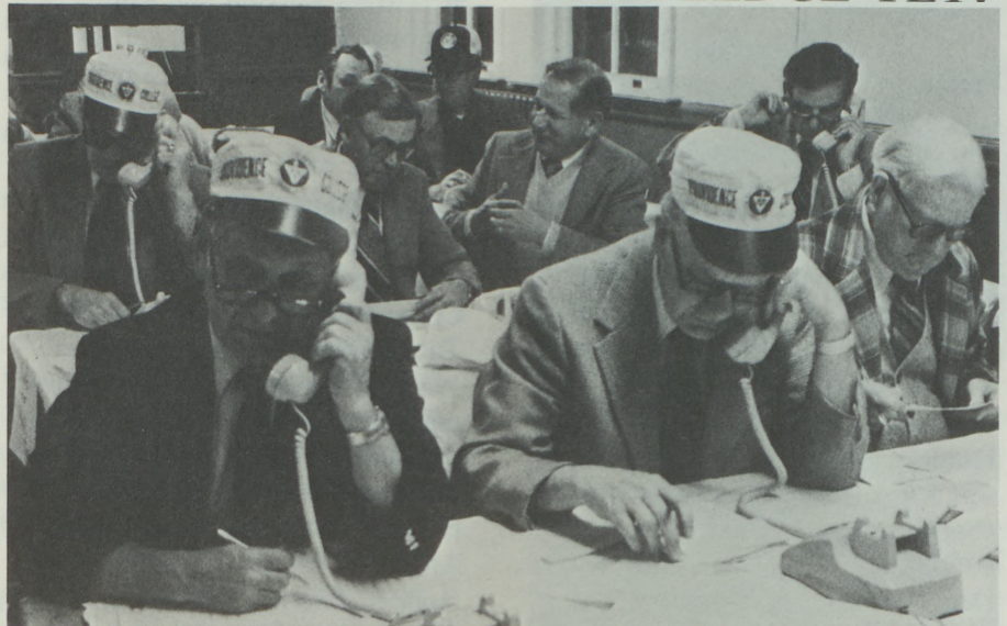
With the help of Ma Bell, volunteers make their final appeals during recent class phonathons.