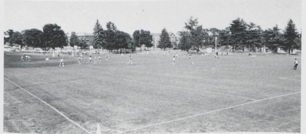
Glax Field, acquired by Providence College in 1975 as part of the Chapin property, is the home of the Lady Friars soccer team.

Admissions Office.....(401) 865-2141 Alumni Office.....(401) 865-2414 Dean's Office.....(401) 865-2495 Financial Aid Office.....(401) 865-2286 Residence/Housing.....(401) 865-2420 Student Services.....(401) 865-2212 Treasurer/Fees.....(401) 865-2284