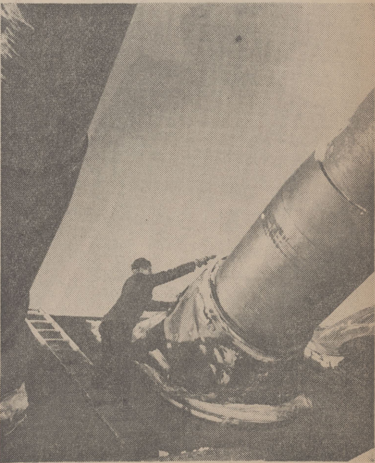
A sailor removing the ice from the "bloomers," or protecting canvas covers, on the barrel of a 16-inch gun.