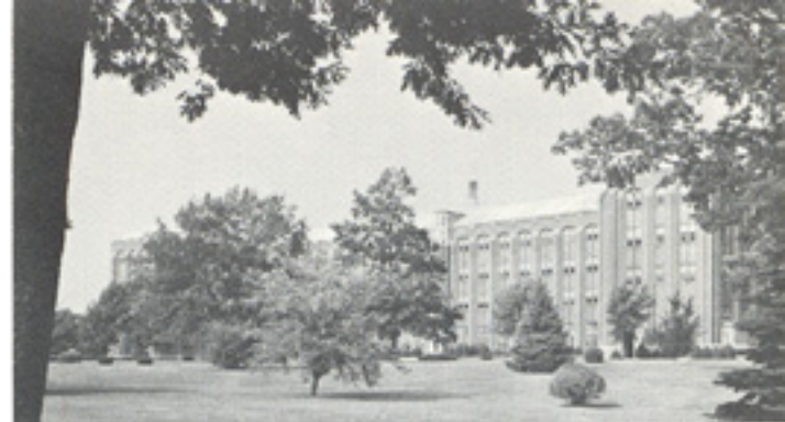
Intellectual stimulation and spiritual renaissance in a relaxed atmosphere.