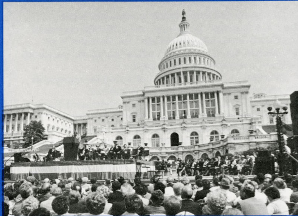
Washington 1983 — Gathering of Survivors at Capitol Building