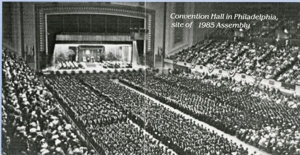
Convention Hall in Philadelphia, site of 1985 Assembly