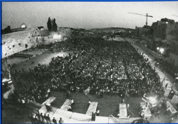
Jerusalem 1981 — Holocaust Survivors Gather at the Kotel